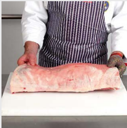
5. Loin with chump – external view.